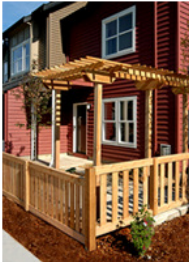
Client: Martha Rose Construction

The financial advantage of using a GreenWorks real estate specialist is our understanding and clear communication of green amenities to homebuyers. Buyers don't just get it on their own, and the homeowner's hard work goes unvalued. GreenWorks agents are trained to know green and how to sell green cost premiums, yielding higher profits to sellers.